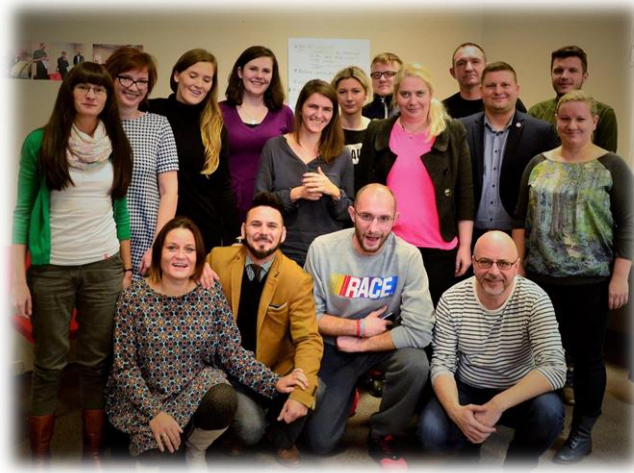
Study Visit on Goji Plantation in Germany

Winning the StartUp Social Initiative in the category "Best idea for social enterprise" - the program runs Ashoka Polska Association supporting social innovators